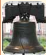
Liberty Bell Philadelphia

Whew! Six days of history that our students will never forget! Now, when they read about our Nation's roots, they'll "see and feel" it in their minds and hearts!