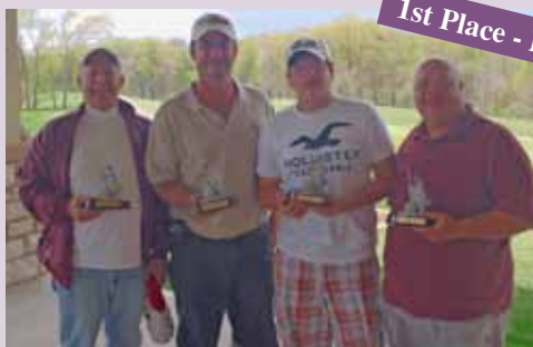
1st Place - B Flight