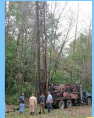
The drilling rig.