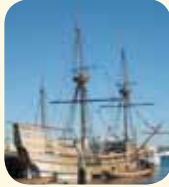
Mayflower II Plymouth

Textbooks, lectures, and historical movies are all components used to teach history and english to our students. Still, there is a disconnect between the students and the reality of our country's history. What can we do to make our nation's people and history really come alive and "feel" real world for our students?