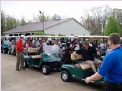
Get Ready, Get Set, GO!

The threat of rain did not ruin or alter our fun day of golf this past April at the Apple Valley Golf Course. All who played were troopers as they showed up on time and were ready to go. The owner of the golf