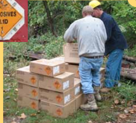
The explosive experts opening the boxes of nitroglycerin.