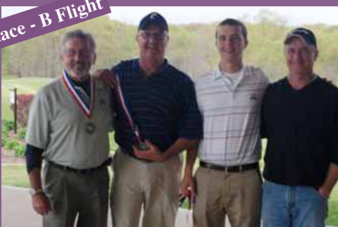
2nd Place - B Flight